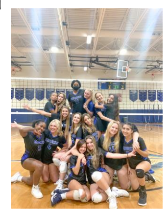
Riverview High School Girls Volleyball team celebrates a successful season.

The Transportation Department has many ways you can access bus run information for your student before school starts. Your student's bus stop location, times, and numbers will be available at the following website: Hillsborough Schools Transportation. It is very important for students and parents to know their bus stop, bus route, bus number, and the bus driver's name. Students are advised to be at their bus stop at least 10 minutes