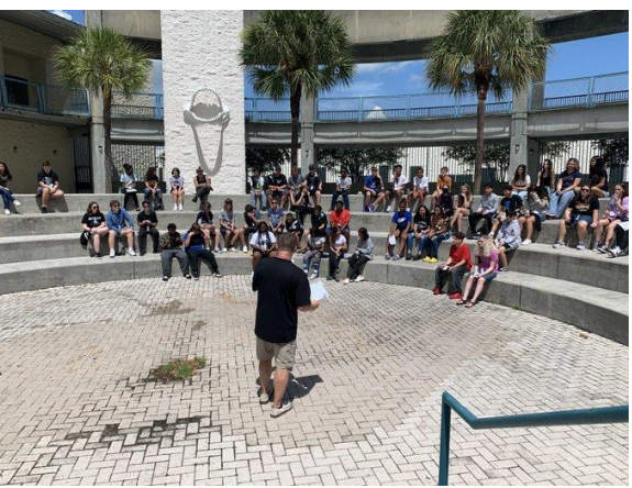
Shark Traditions: Incoming Freshman listening to instructions during Freshman Frenzy

The first day of school for students will be Wednesday, August 10<sup>th</sup>, 2022. All students will report to their homerooms first on the first day of school. Look at the personalized information on the postcard mailed to your home to determine